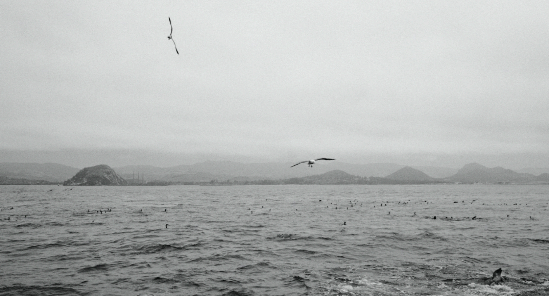
Left: Feeding Time Morro Bay, CA Fujifilm X100V Kodak Tri-X 400 recipe ISO 1600, 1/6000, f/9