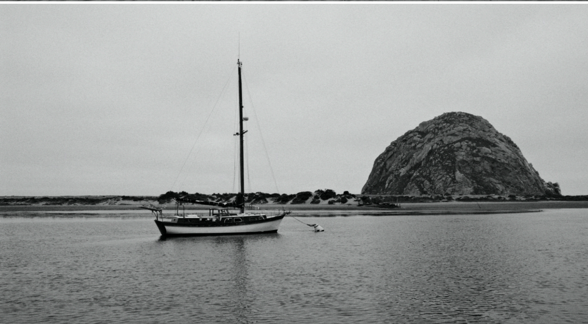
Left: Morro Rock & Boat Morro Bay, CA Fujifilm X100V Kodak Tri-X 400 recipe ISO 1600, 1/5400, f/5.6