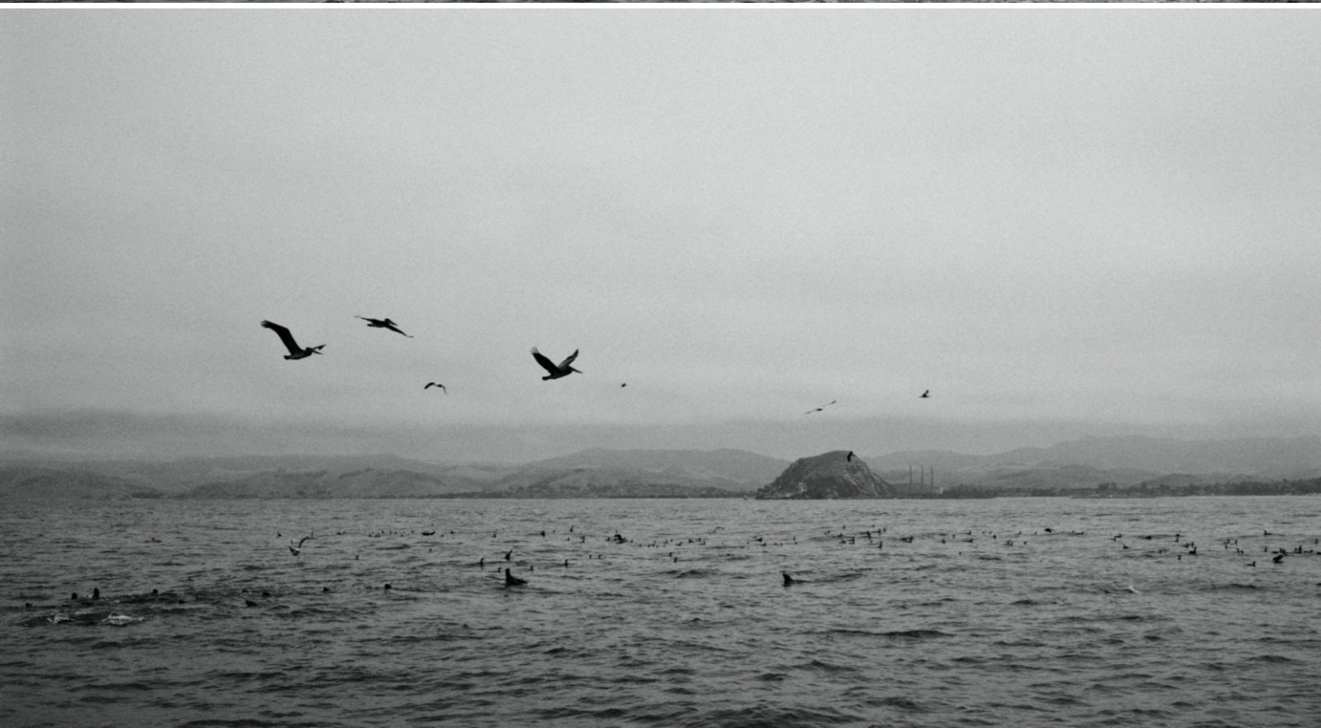
Left: Birds in Flight Morro Bay, CA Fujifilm X100V Kodak Tri-X 400 recipe ISO 1600, 1/6000, f/9