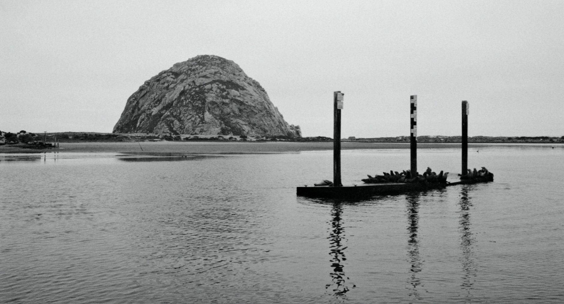
Left: Rock & Sea Lions Morro Bay, CA Fujifilm X100V Kodak Tri-X 400 recipe ISO 1600, 1/5000, f/5.6