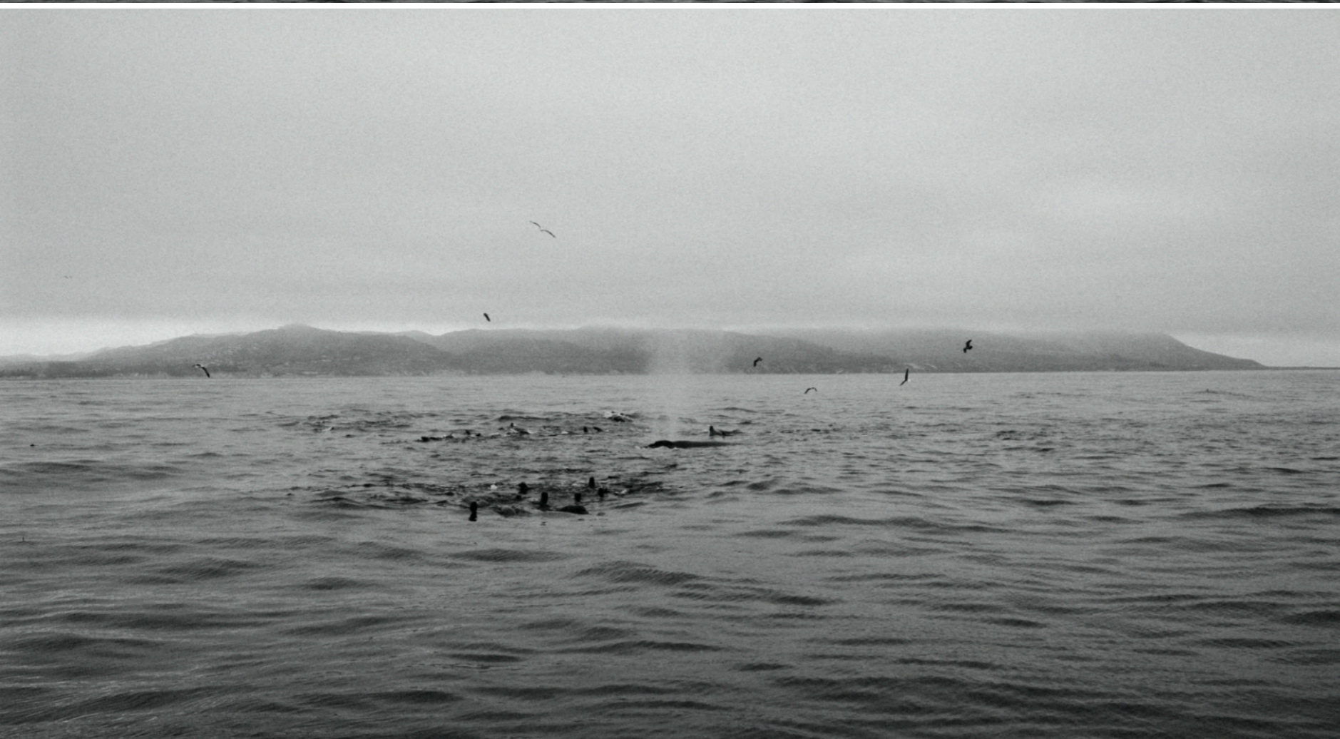
Left: Whale Underwater Morro Bay, CA Fujifilm X100V Kodak Tri-X 400 recipe ISO 1600, 1/3500, f/8