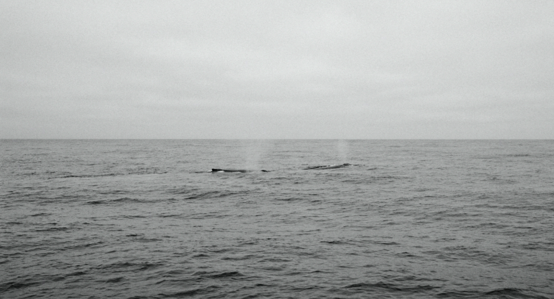
Left: Two Spouts Morro Bay, CA Fujifilm X100V Kodak Tri-X 400 recipe ISO 1600, 1/3000, f/9